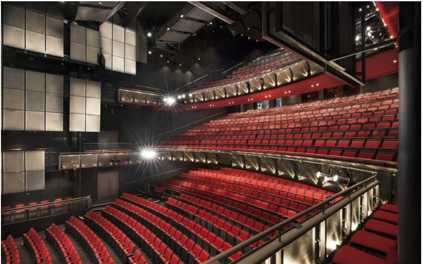
Sadler's Wells Theatre

We welcome all applications by 11.59pm GMT on Sunday 5 June 2022. Interviews will take place on 16 June 2022.