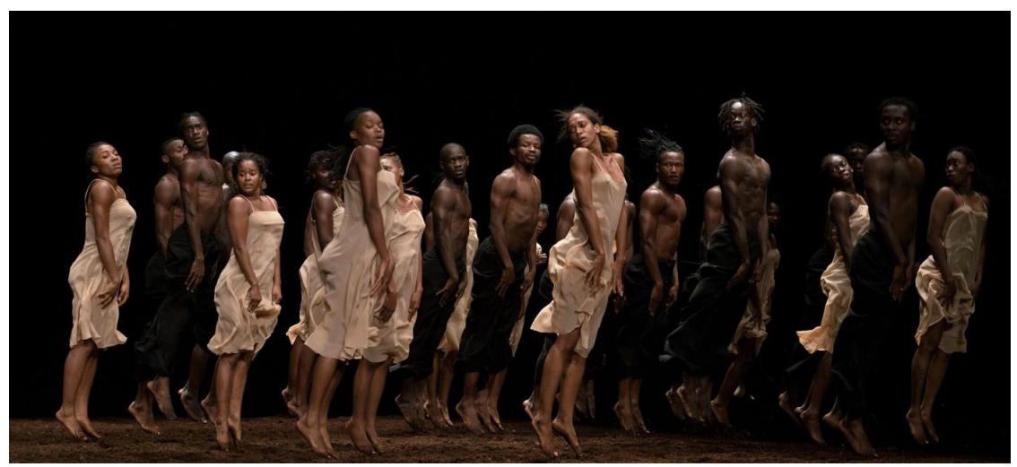
The Rite of Spring